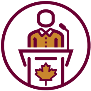
Toolkit 1 Running in a Federal Election