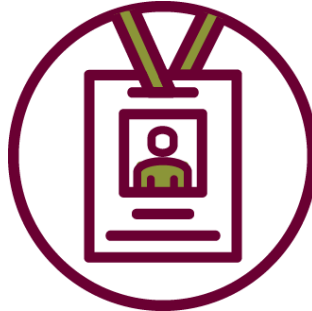
Toolkit 2 Working at a Federal Election