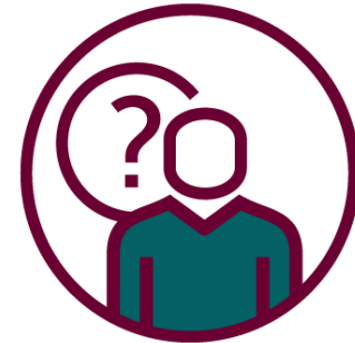
Toolkit 3 Registering and Voting in a Federal Election